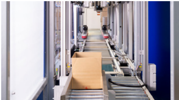
1. DETECTION OF BOX FORMAT AND PRODUCT HEIGHT WITHIN THE BOX