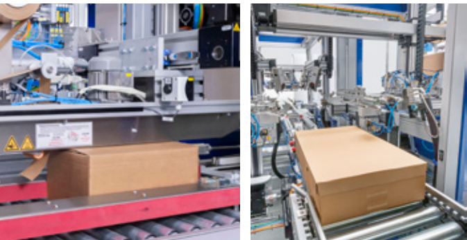
4. SEALING WITH SELF-ADHESIVE/ GUMMED PAPER TAPE AND*/OR WITH LID