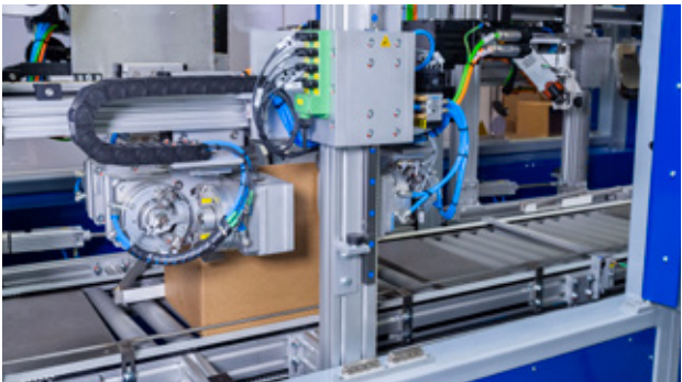
3. FOLDING OF LID FLAPS