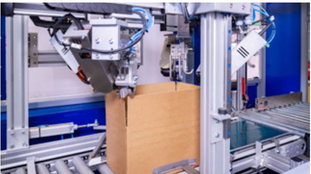
2. CUTTING OF BOX CORNERS